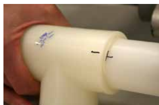
TABLE 2 – PIPE INSERTION LENGTH

NOTE: Never dip the joint into water or expose it to a forced airstream in order to cool it quickly as this will result in weak joints.