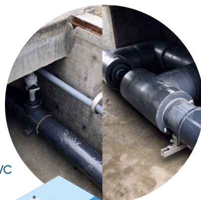
IPEX Guardian™ PVC

This phase is just the first of four phases planned over the next decade to increase the potable water supply that serves the citizens of local North Texas communities. Each phase will see an increase of 70 million gallons added to the water treatment cycle, for a total of 280 million gallons processed at the Leonard Treatment Plant.