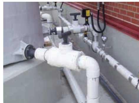
IPEX double containment ball valves were used.

For the double containment system, the North Toronto plant used the Guardian ™ Vinyl double containment system from IPEX. The Guardian system is comprised mostly of 2" Xirtec ® 140 Schedule 80 PVC carrier pipe inside a 4" Xirtec140 Schedule 40 PVC containment pipe. Some portions of the system also used 1" Xirtec140 Schedule 80 PVC inside a 3" Xirtec140 Schedule 40 PVC. To reduce system installation and maintenance costs, the Guardian system features a patented Centra-Lok ™ design that allows the system to be installed with full 20-foot lengths, while keeping the carrier pipe perfectly centered inside the containment piping. The system is also available in spool piece fabrications according to specific application designs.