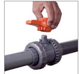
Easyfit Multifunctional Handle