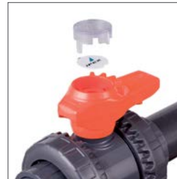
Easyfit Custom Labelling System

D eveloped by Merlin Entertainment, the Sea Life Kansas City Aquarium is a popular destination for both tourists and local residents. Situated in the Crown Center close to Downtown Kansas City, the aquarium boasts 30 special displays, educational programs, touch pools, and a glass tunnel that lets you walk on the simulated sea floor surrounded by water brimming with sea life. In all, the aquarium