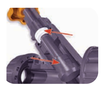
SEALING SURFACES AND PACKING – PVC swivel plug and gland and PTFE packing allow for tight contact sealing with body to provide on-off capability for clean fluids.