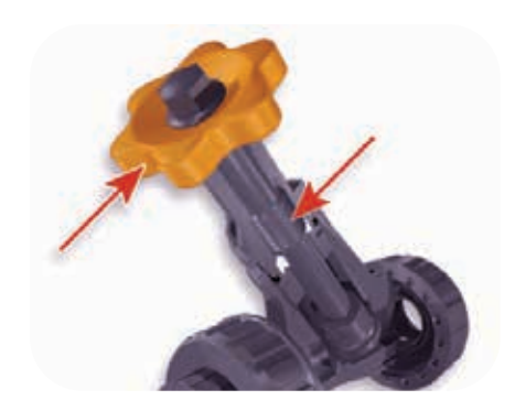
HANDWHEEL AND THREADED STEM - Multiple threads allow for precise, linear throttling of flow using multi-turn ergonomic handwheel.