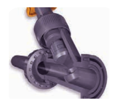
HIGH FLOW CAPACITY – High flow coefficients with reduced turbulence and friction loss.