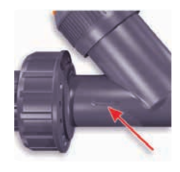
FLOW INDICATOR – The molded flow direction indicator on the side of the body ensures that the valve is installed in the proper direction.