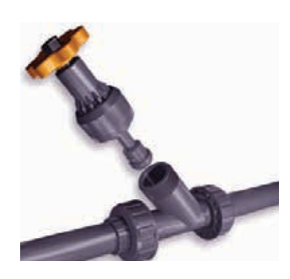
TOP-ENTRY DESIGN – The Y-pattern body allows for maintenance of the swivel plug and gland without removing the entire valve from the system.