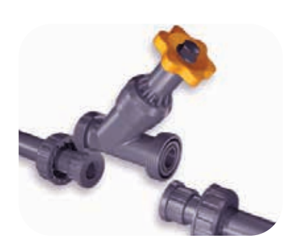
TRUE UNION DESIGN – Allows for simple installation and removal without disturbing the rest of the pipe assembly.