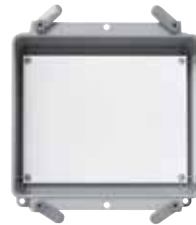
JBXH12106 – JBXH161610