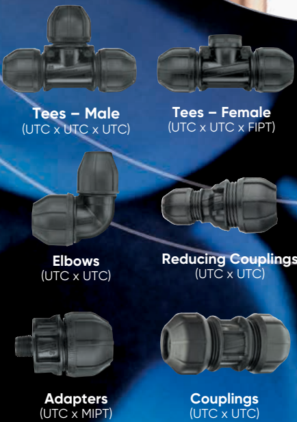
Tees – Male (UTC x UTC x UTC)