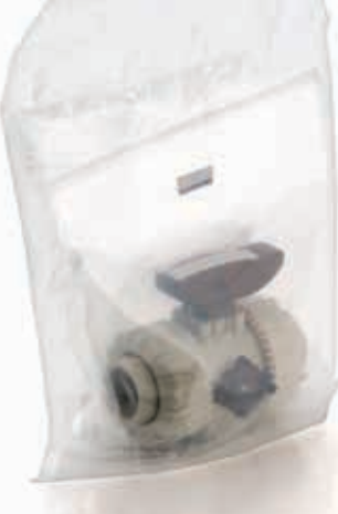
All Silicone free valves are double bagged to prevent contamination

IPEX silicone free valves are expertly cleaned within a new clean room facility, conforming to ISO 14644-1 clean room standards. The facility utilizes a three stage chemical cleaning process, including ultrasonic cleaning tanks, to ensure all valve components are free from traces of silicone. The valve is then dried using a compressed air system and bagged within a dual skin silicone free package to prevent contamination. In addition, a non-silicone lubricant is used for both the ball valves and butterfly valves to maintain efficient operation over the lifetime of the system. With this technology, valves are supplied to you silicone free by IPEX.