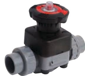
DK Series Diaphragm Valves