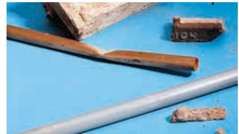
Tough and Durable

The butadiene component in ABS gives the material exceptional strength, especially in the form of impact resistance, making Duraplus more resistant to damage than many metals or plastics. Duraplus ABS has a wide operational temperature ranging from 140°F (60°C) and remains ductile at temperatures as low as -40°F (-40°C). This ductility allows the material to function at these low temperatures without risk of brittle fracture due to impact.