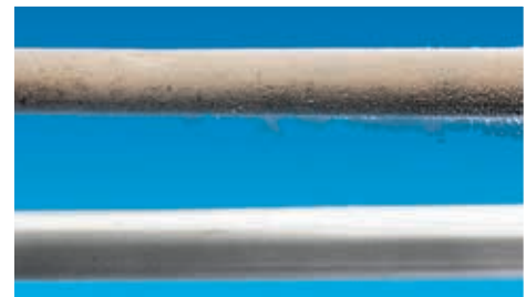
Low Thermal Conductivity

At half the weight of copper and one-sixth the weight of steel pipe, ABS is much easier to handle and install.