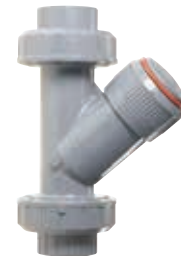
RV Sediment Strainer