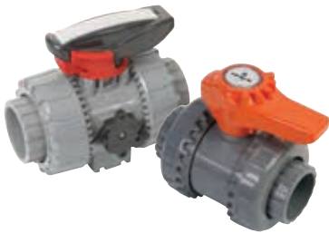
VKD & VXE Series Ball Valves