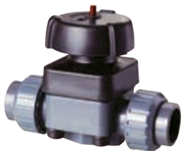
VM Series Diaphragm Valves