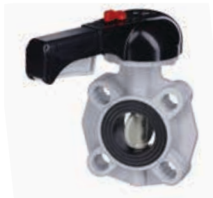
FK Series Butterfly Valves