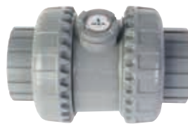
SXE Ball Check Valves