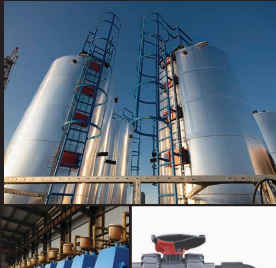
CHEMICAL PROCESSING INDUSTRY SOLUTIONS