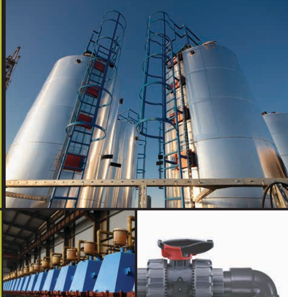
CHEMICAL PROCESSING INDUSTRY SOLUTIONS